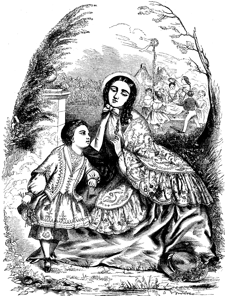
FIGURES 1 AND 2.—OUT-DOOR COSTUME AND CHILD'S DRESS.