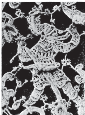
VENETIAN POINT, ABOUT 1725