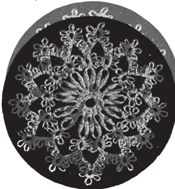
Medallion in Coronation-Braid and Crochet

For the medallion: Chain 7, join. 1. Fill the ring with 13 doubles, join. 2. Take a strip of coronation-braid, insert hook in 1st double, take up thread and draw through, then draw a loop over the stem between 2 rolls of braid, take up thread and draw through both stitches; insert hook in next stitch, draw through, miss 1 stem of braid and draw a loop over the next; continue until you have 13 loops of braid around the center and join the ends evenly, at the stem, by sewing. 3. Make a ring of 2 double knots, (1 picot, 2 double knots) 5 times, joining by middle picot to stem between 2 rolls of braid; close; * with 2 threads make a chain of 2 double knots, (picot, 2 double knots) 3 times, a ring as first described, a chain like last, a ring, joining by middle picot to stem between next 2 rolls of braid; repeat from * around, making 15 points in all, and fastening last chain at base of 1st ring, and fasten off.