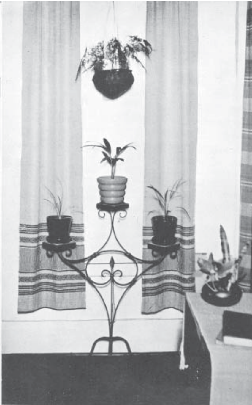
Illustration No. 1

Corner in hall showing window and portion of door hanging