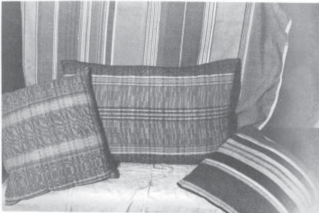
Illustration No. 4 Blanket and pillows