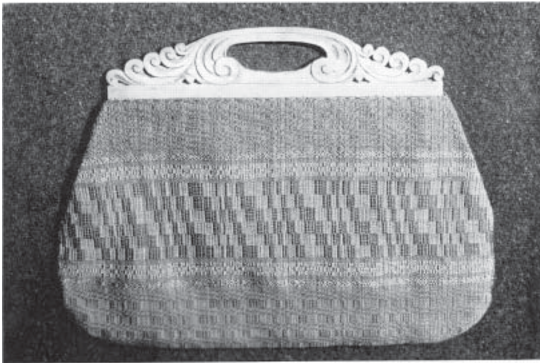
Illustration No. 5 Bag with hand-carved top

a plain tabby weave in several shades of green, hennas, yellows and black and finished with a binding of grosgrain ribbon, as shown in the back of Illustration No. 4.