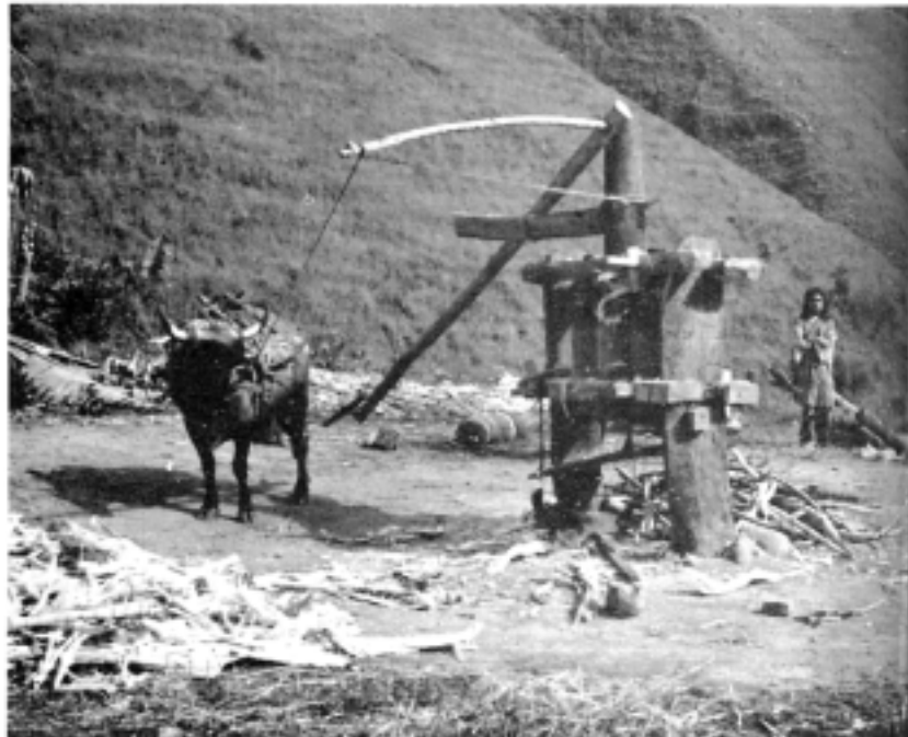
PLATE 180.—Cágaba industries at San Miguel. Top: Weaving. Bottom: Sugarcane mill.