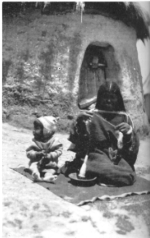
PLATE 116.—Uru and Chipaya weaving and spinning. Top: Uru woman working at native loom. Bottom (left): Chipaya man at upright loom. Bottom (right): Chipaya woman spinning.