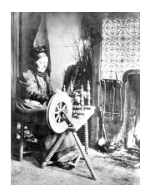
Illustrations from the Book