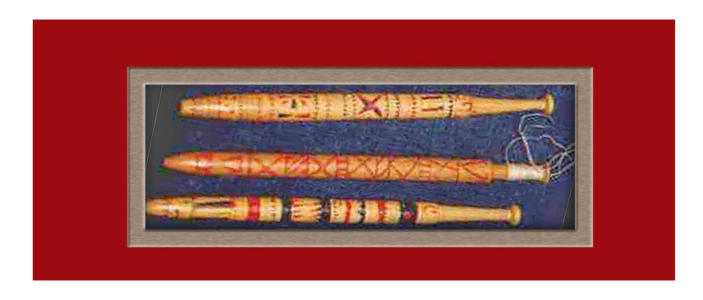
This shows a wide variety of simple decorations

We mainly talk of the decorator's art as applied to these East Devon bobbins as being "chip carved" with a unique triangle shape as being the main component of the design. It is thought that these triangular cuts or indents are filled with either black or red wax. I need to add that by no means are all bobbins decorated in this manner, just what we might call the typical bobbin decoration.