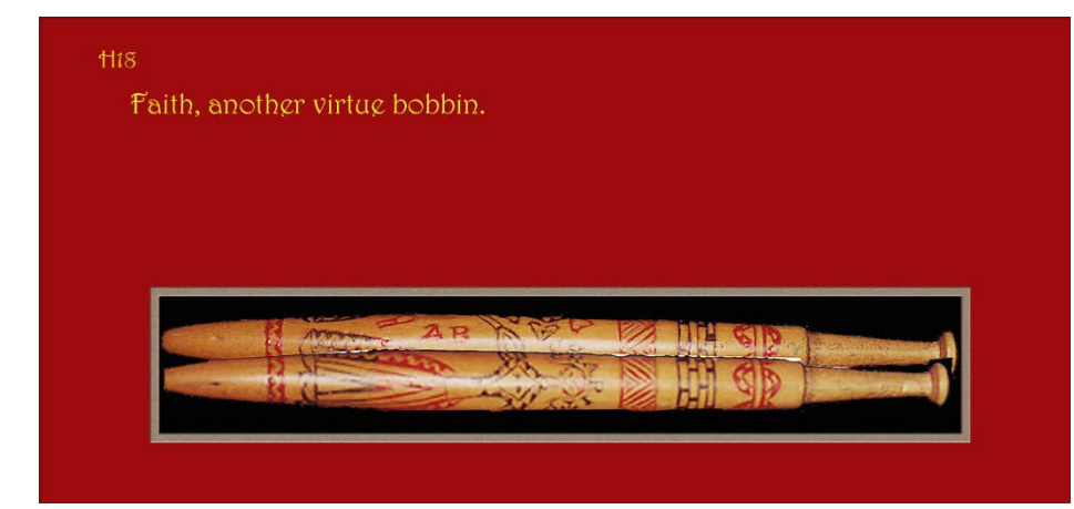
Part 1. Primitive inclusions

I am doing this in two galleries, firstly those that include an article of somewhat primitive art within an otherwise traditionally decorated bobbin, and secondly those I think are primitive within the whole of their concept.