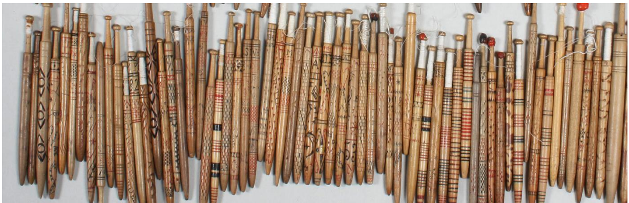
A mix of Honiton Bobbins