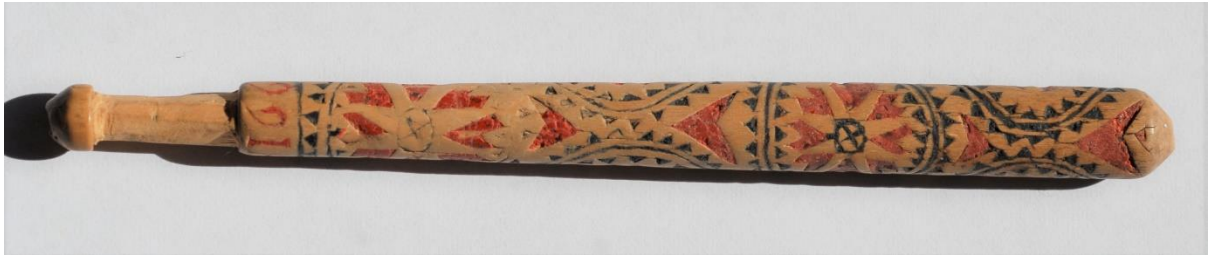
A Honiton Trolley dated 1662

It is ironic that my wife for some 59 years has monthly, weekly, daily, told me to "look properly" as I open the fridge or a cupboard and fail to see an object that is looking me straight between the eyes! Now I am extolling you to take a good look at your bobbins. Smile!