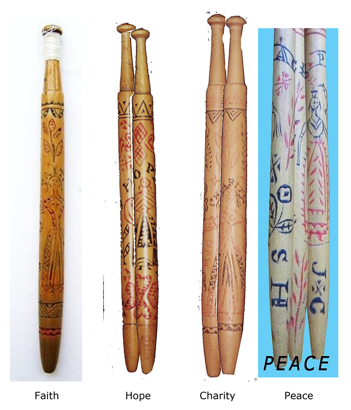
Firstly, I am showing you a sample of the single figures of the three main virtues and the Peace virtue (see above)

In trying to date these dresses I came to the rough conclusion that dresses of this type could well have been worn in the first half of the 1700s. [Perhaps one of you experts (SRA members etc.) would be kind enough to help me: I am on the Arachne list)