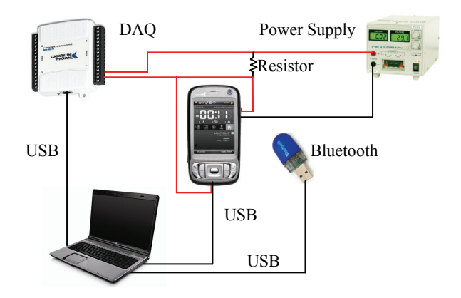
Fig. 1. Profiling environment

Figure 1 shows the profiling environment. The HTC TyTN II phone is connected directly to the power supply to provide constant voltage and reduce complexity of energy measurements. Since this phone, like most modern phones, require communication with the battery in order to operate, we have reused some of the electronic components from the battery pack and wired them directly to the power supply. The current draw is calculated by capturing the voltage drop across a 100m\Omega current sense resistor wired into the phone's