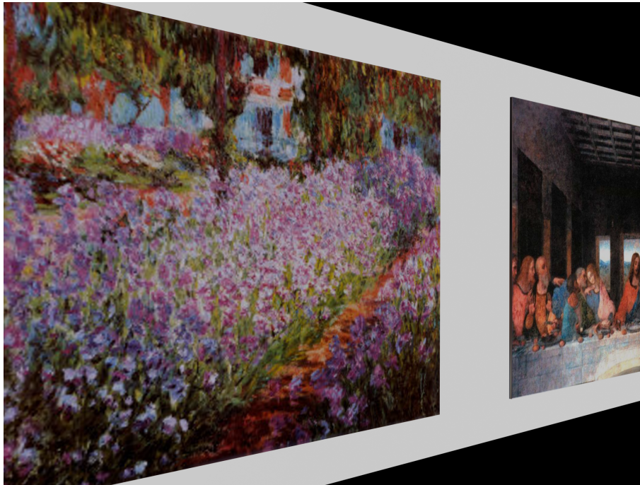
Figure 1. Scene concept: perusing a wall of art.

This assignment may be done in teams of two. Due Feb 21, 2012 by 11:59PM via D2L. .