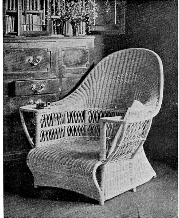
"The Pilgrim's Quest"