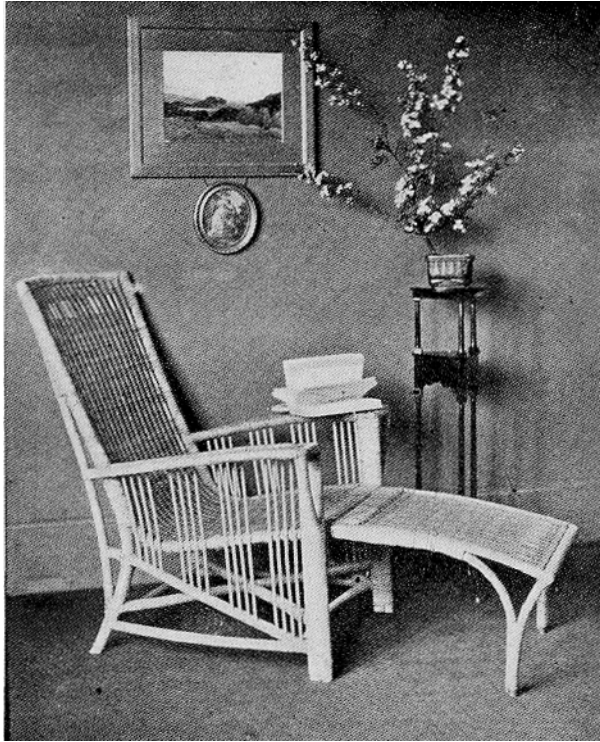
"The Sluggard's Lure"