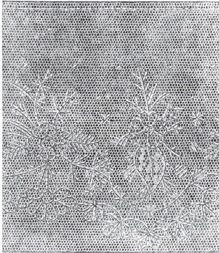
FIG. 4.—BEADED LACE.

Jetted and beaded lace are still very fashionably worn, and the great improvements recently made in the finish of beads renders this style of trimming valuable, both for durability and appear-