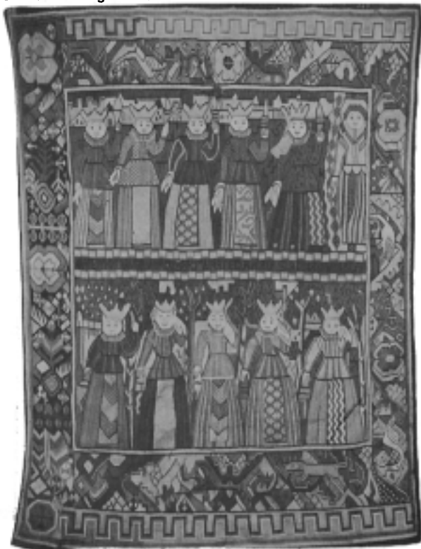
A large Norwegian tapestry entitled "The Wise and Foolish Virgins" from the 18th Century; part of the Minneapolis Institute of Arts Textile Collection.

The collection houses samples of woven and surface ornamented textiles which originated in over fifty different countries and exemplify a wide range of techniques from the simplest weave to elaborate brocades and velvets, as well as ikat, needlepoint, tambor work, couching, crewel embroidery, batik, copperplate and woodblock prints. There are very few examples of Scandinavian textiles, and in terms of numbers, the strength of the collection lies east of Istanbul. However, there are over 200 examples of Italian and French fabrics made in the sixteenth through the nineteenth centuries.