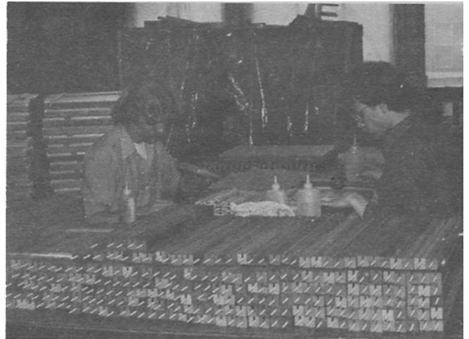
Workers gluing dents in warp beams