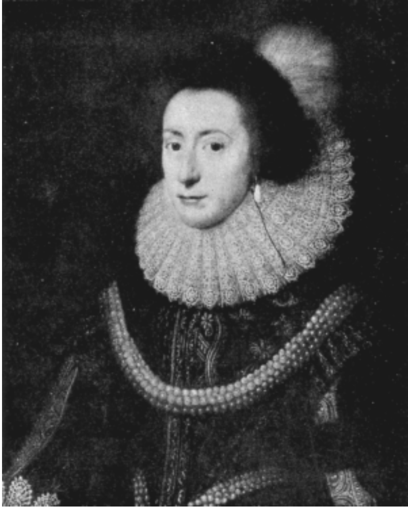
PORTRAIT OF THE PRINCESS ELIZABETH, DAUGHTER OF JAMES I BY HONTHORST