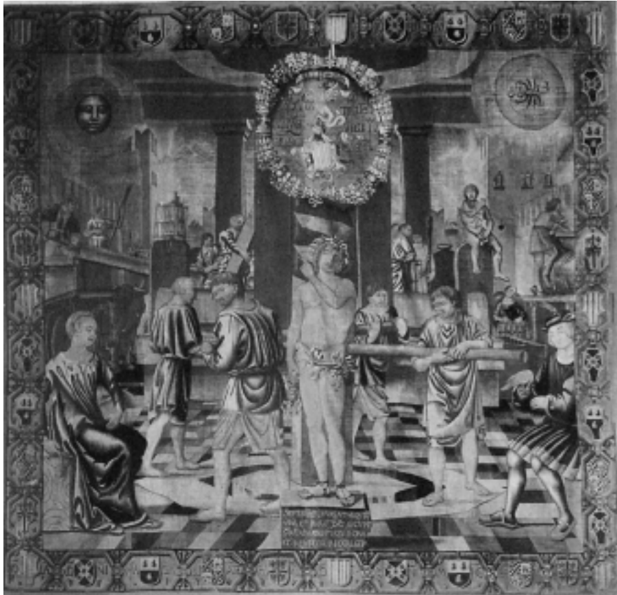
PLATE X. SEPTEMBER.