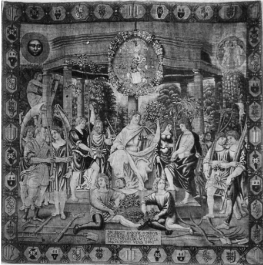
PLATE VI. MAY.