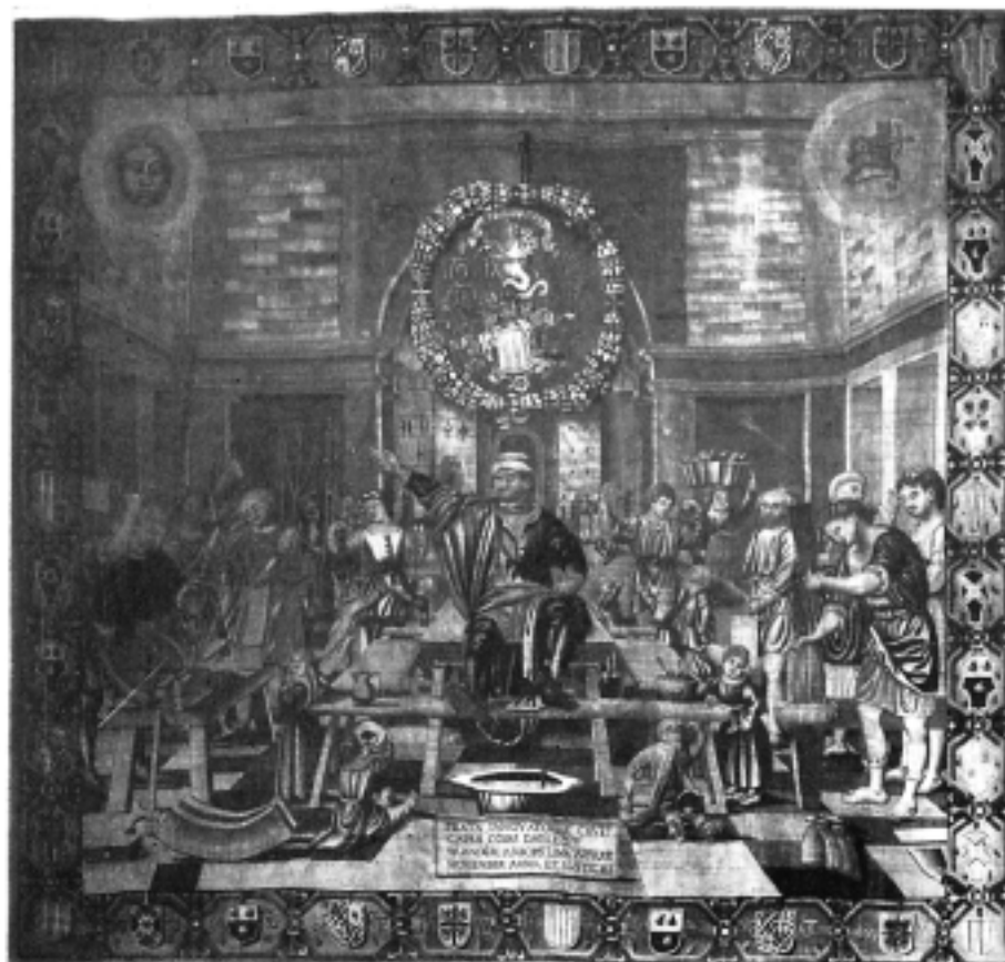
PLATE XII. NOVEMBER.