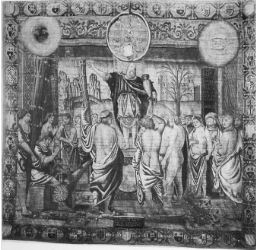
PLATE XV. FEBRUARY.