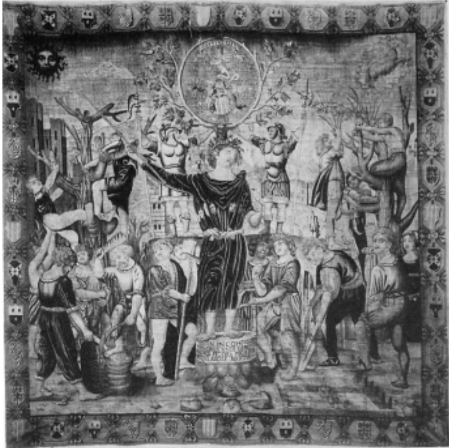
PLATE IV. MARCH.