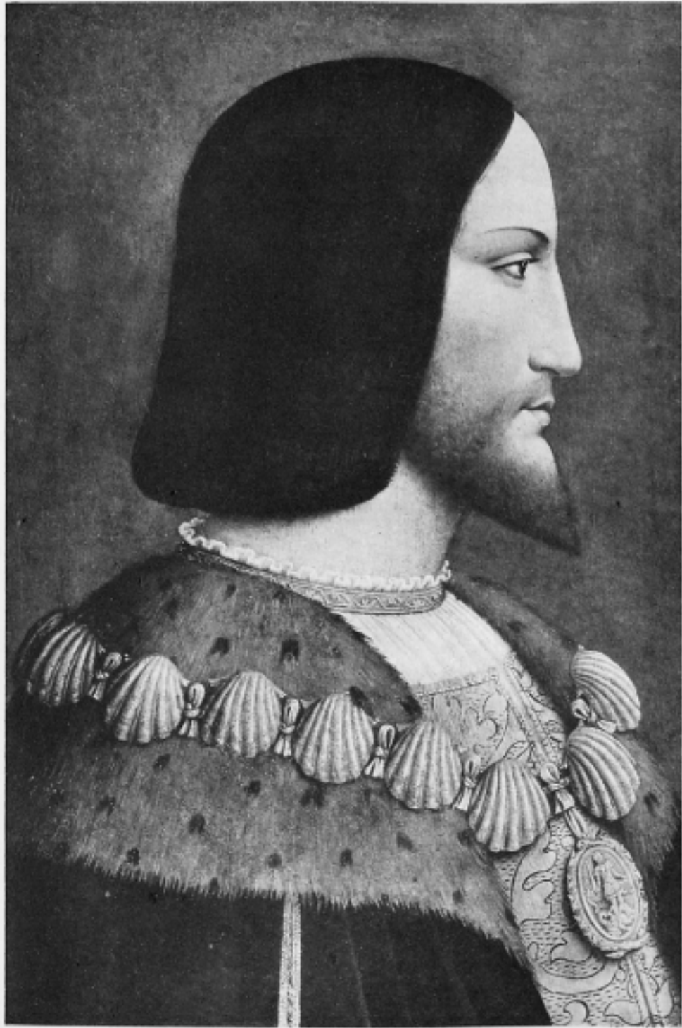
PLATE III. PORTRAIT OF GIAN NICOLO TRIVULZIO BY BERNARDINO DEI CONTI.