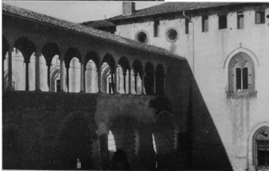
PLATE 1b (BELOW). INNER COURT OF THE CASTLE AT VIGEVANO.