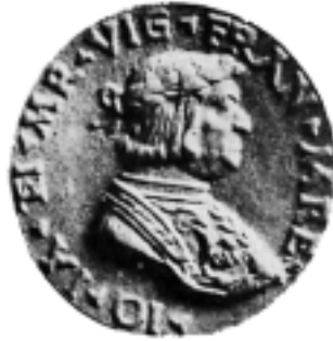
PORTRAIT MEDALLION OF MARSHAL TRIVULZIO.