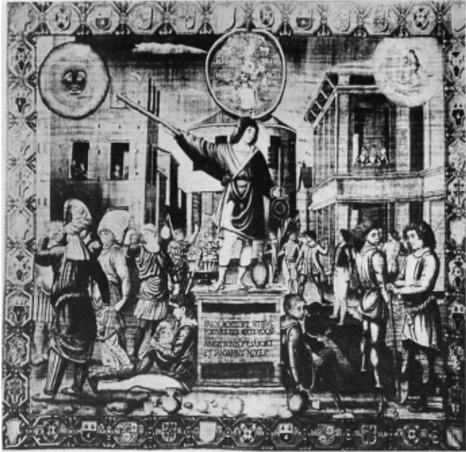
PLATE XIV. JANUARY.