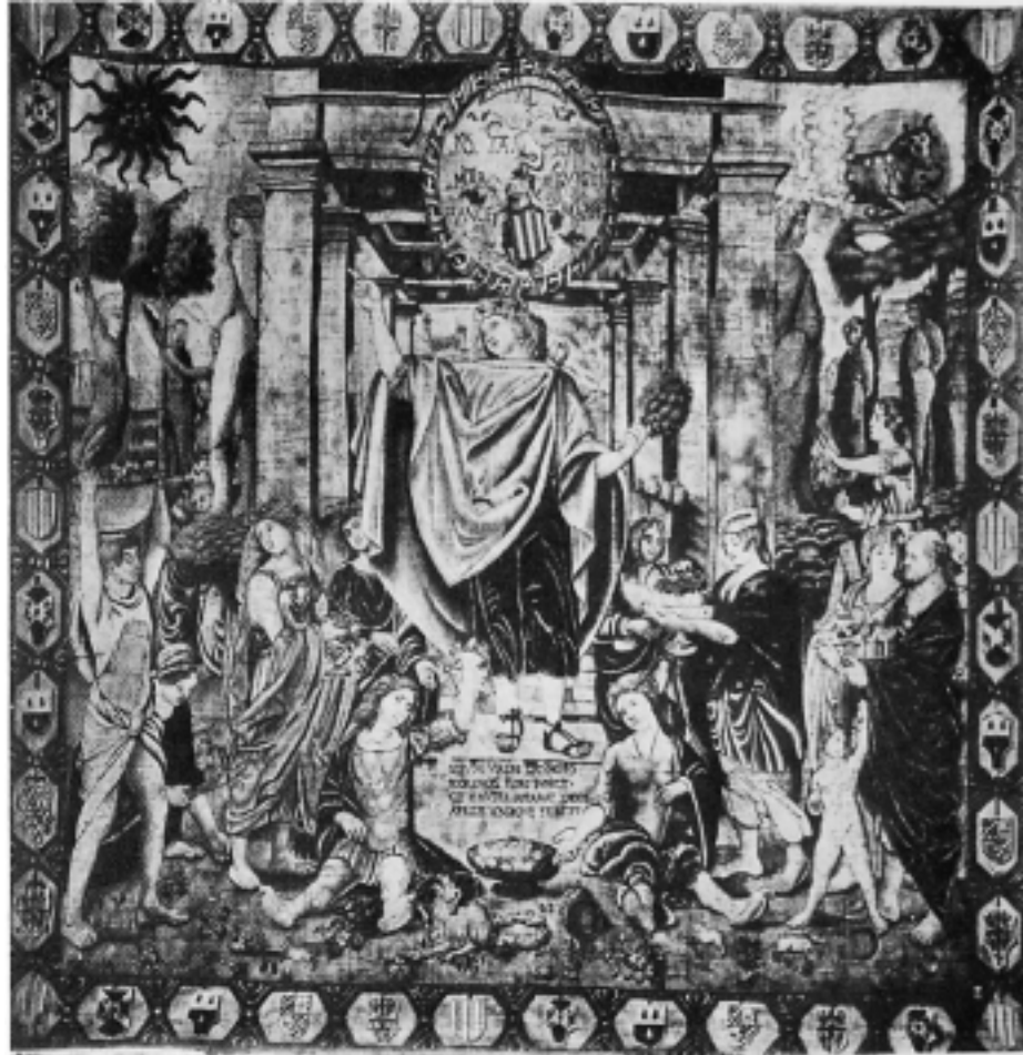
PLATE V. APRIL.