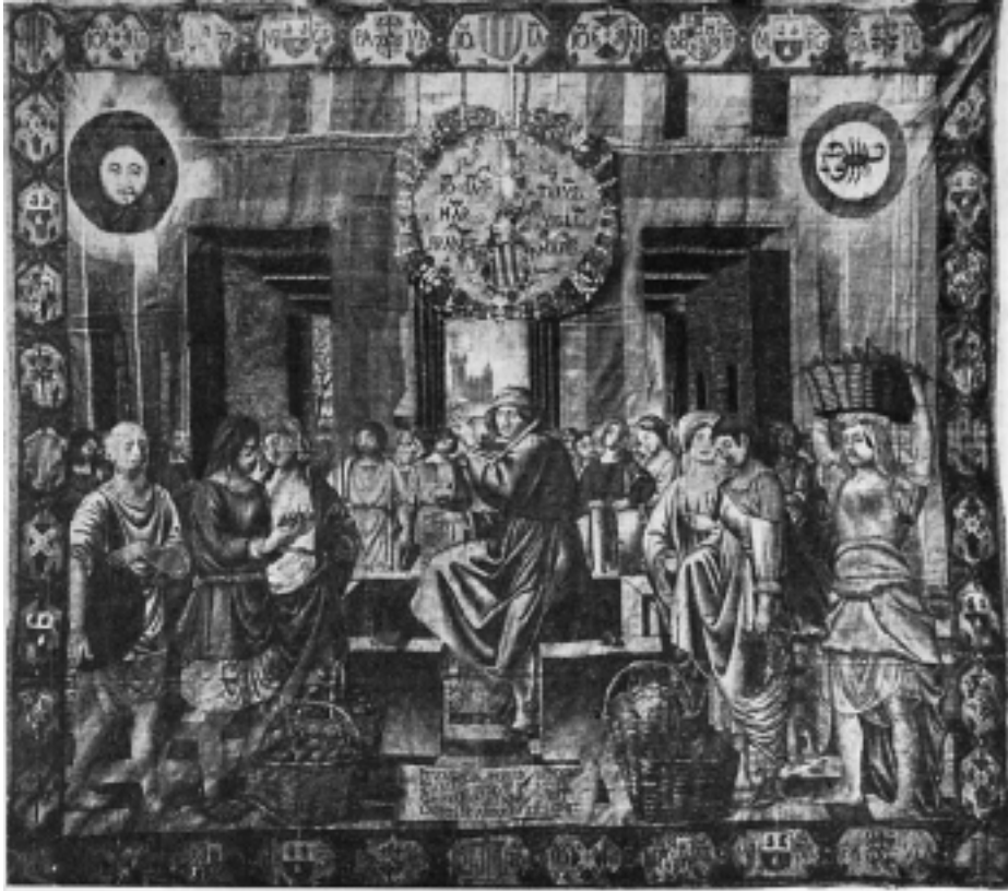
PLATE XI. OCTOBER.