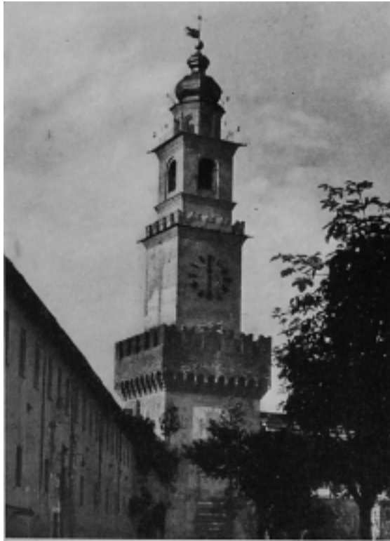
PLATE 1a (LEFT). THE CASTLE AT VIGEVANO PRESENTED TO MARSHAL TRIVULZIO BY LOUIS XII.