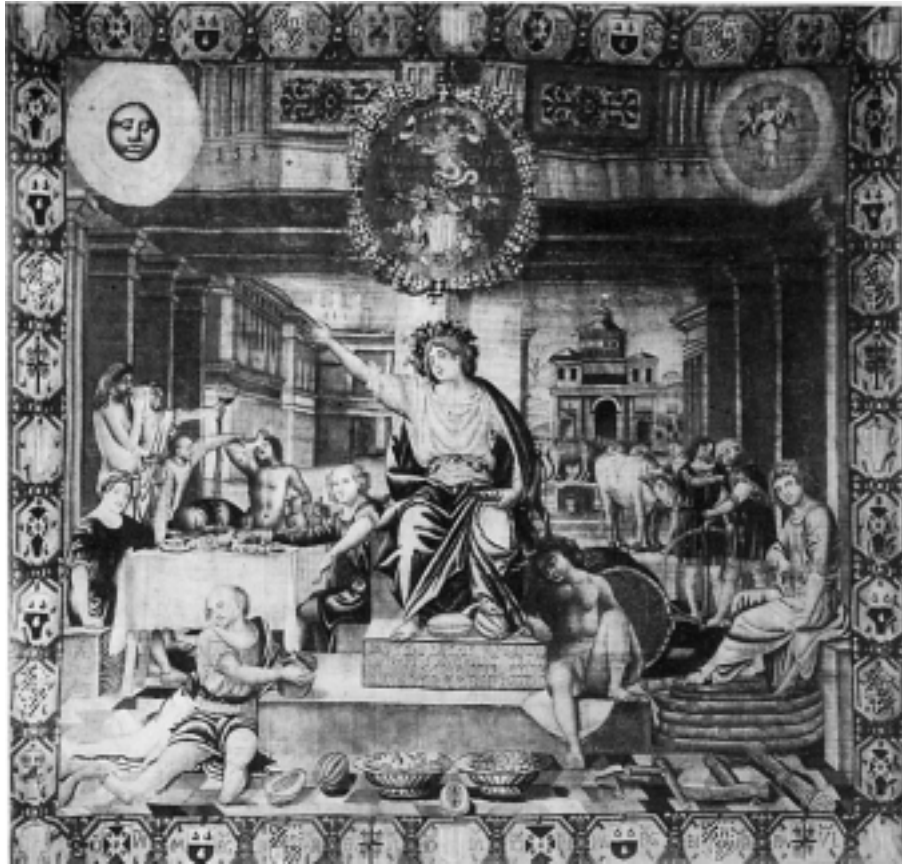
PLATE IX. AUGUST.