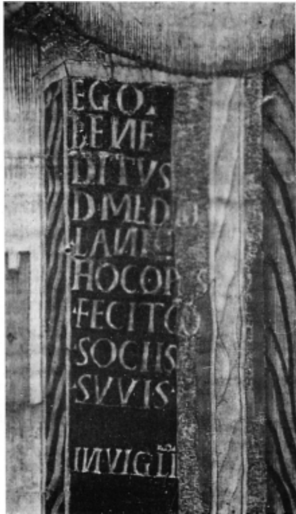
PLATE XVI. DETAIL OF INSCRIPTION.