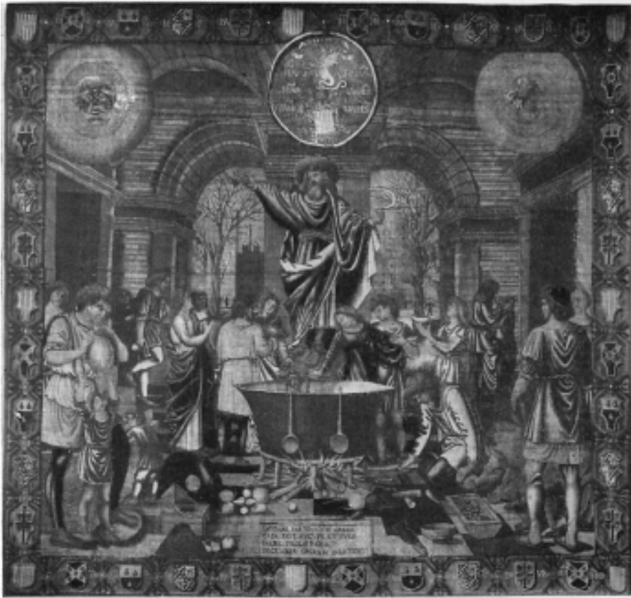
PLATE XIII. DECEMBER.