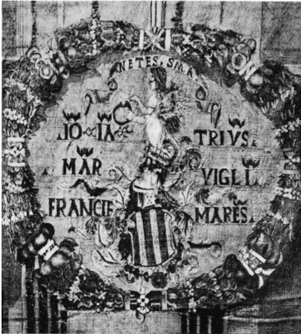
FRONTISPIECE: THE ARMS OF MARSHAL GIAN GIACOMO TRIVULZIO.