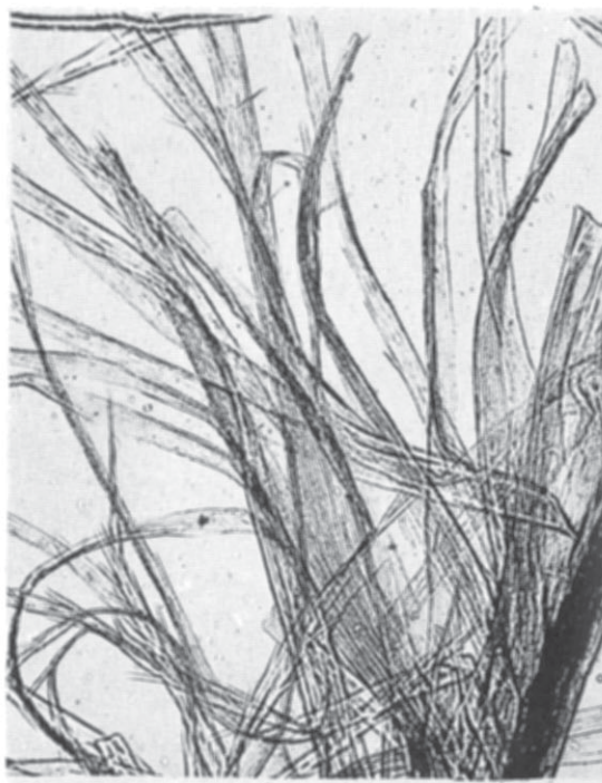
Figure 4 Ostrich Feather 120X

The effect is very peculiar because the feather pieces are distributed, as can be easily seen from Figure 1. Even with a common magnifying glass it can be seen that these effect