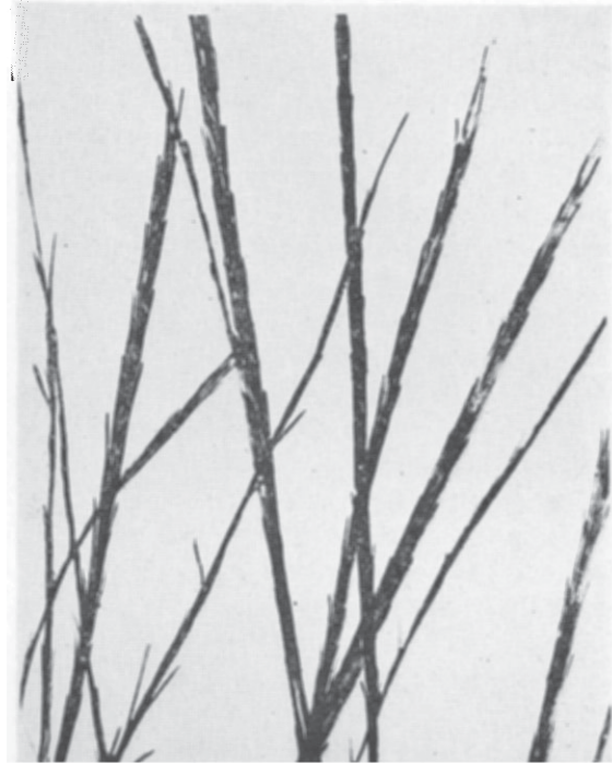
Figure 6 Ostrich Feather Ends 120X

ostrich feather. The little feathers shown in Figure 2 were completely mixed with each other through the physical and chemical influences of manufacturing. On the pictures 4 and 5 the building-up of the feathers can be seen much better, as it is magnified 120 times.