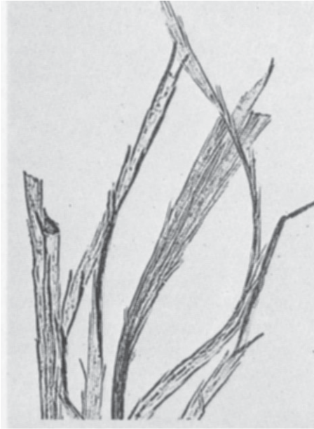
Figure 5 Ostrich Feather Ends 120X

The fine feathers branching off from the quill are ribbon-formed and end in a single or double point. From these feather branches,