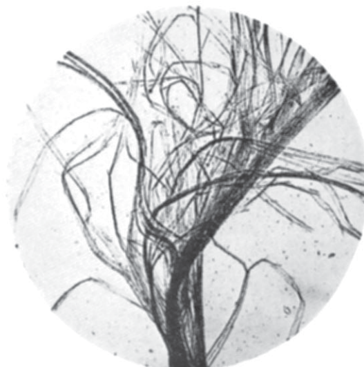
Figure 2 Ostrich Feather 40X