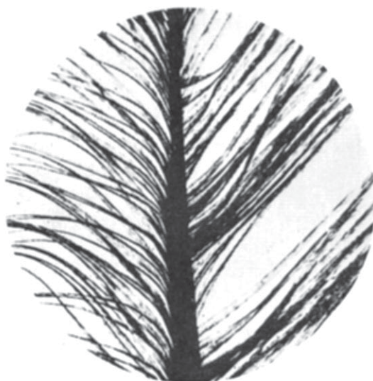
Figure 3 Ostrich Feather 40X

During the search for even newer and more peculiar effects the fiber-skins of the ostrich feather were found to be particularly adaptable for these purposes. The feathers, mostly waste-material, are cut into short pieces and then mixed in with the wool in wolfing.