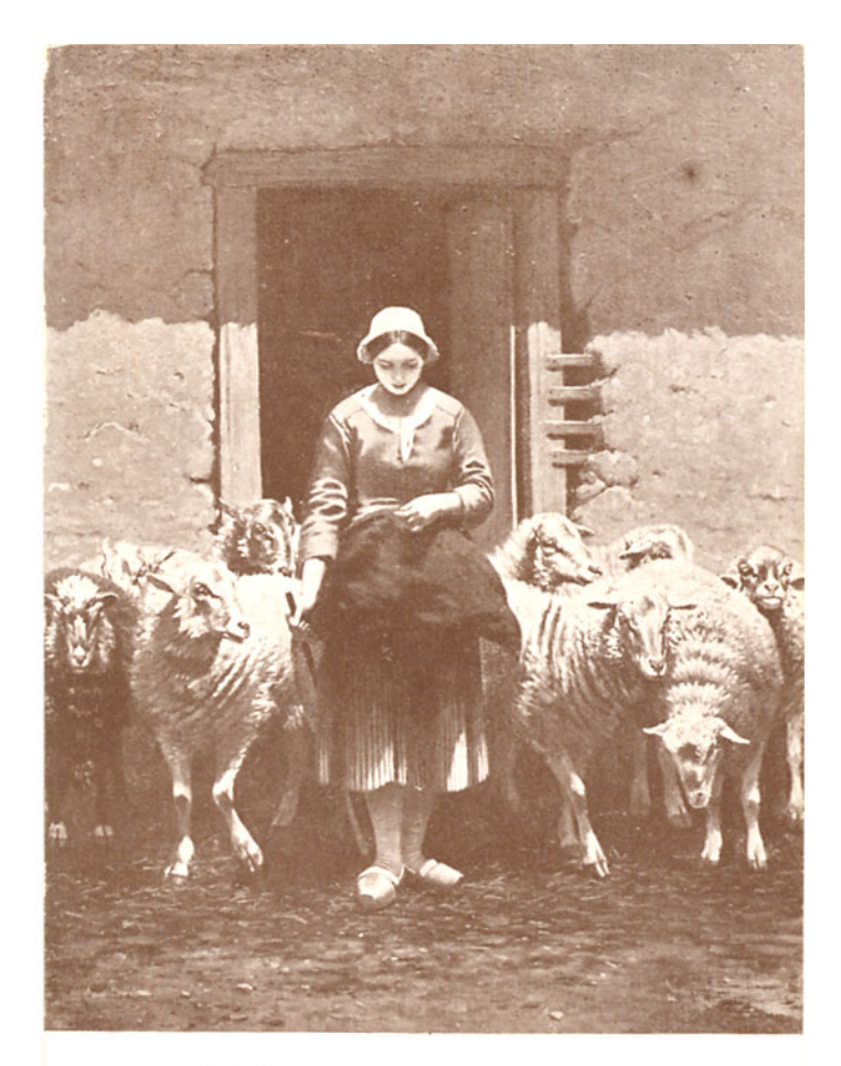
Shepherdess and Sheep—C. Troyan. Prince of Wales Museum of Western India, Bombay.