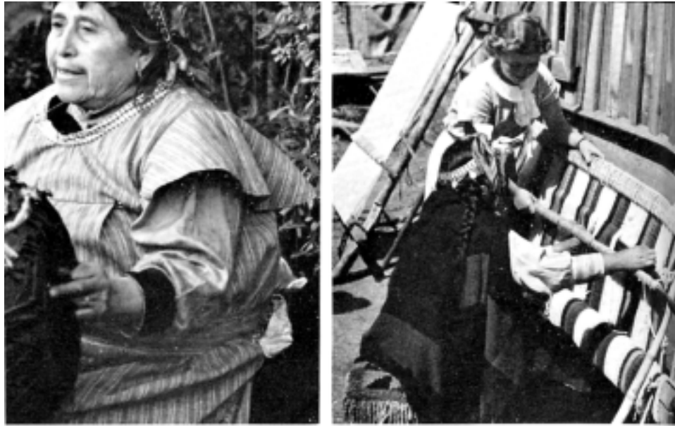
PLATE 156.— Araucanian Indians. Top (left): Mapuche female shaman. Top (right): Mapuche woman weaving. (Courtesy Grace Line.) Bottom: Mapuche girl. (After Looser, 1927, opp. p. 3.)